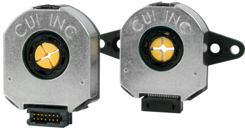
FIGURE 2 CUI's AMT encoder family is the first on the market to employ a digital ASIC-based design.

The incorporation of diagnostic capabilities into the rotary encoder provides the designer access to valuable system data that previously was not available in pure analog solutions. This data can be used to quickly allow the system to determine if the encoder is operating properly, has failed or become inoperable, or has become misaligned. The system can then use this data to inform operators of potential issues or to make informed decisions on its own before turning on the motor and causing potentially disastrous damage. Furthermore, engineers can use this feature for preventative measures - for example, executing an "encoder good" test sequence before running the application. These capabilities, not available in strictly analog encoders, allow designers to keep downtime to a minimum while anticipating issues that might occur with units in the field.